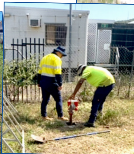
ABOVE: Lex Wotton tests the flow and pressure from a hydrant; FAR LEFT: All the hydrants were recorded with GPS coordinates so that they can be accurately located in the future; LEFT: Some of the hydrants were difficult to find, but they did it